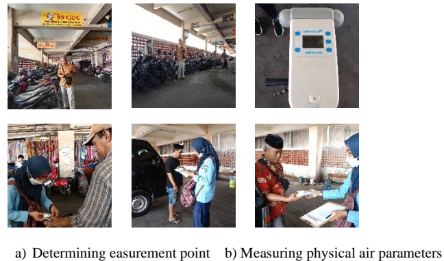
a) Determining easurement point b) Measuring physical air parameters c) Measuring CO gas levels d) Measuring oxygen saturation e) Recording measurement result f) Giving antiseptic to people

The research procedure is divided into sources and types of data. The primary data in this study includes the results of physical air measurements (temperature, humidity, and wind speed), chemical air measurements (CO gas), oxygen saturation, and interviews. The secondary data for this study was obtained from PD Pasar Surya. The research instruments consist of observation sheets and interviews to support the study. Air sampling was carried out by technicians from the Environmental Engineering Laboratory of ITS Surabaya using the NDIR method according to SNI 7119.10:2011, the testing method for carbon monoxide levels. The examination of oxygen saturation levels was conducted using a pulse oximeter, following the procedure of having the parking attendants wash their hands with hand sanitizer, ensuring their fingers were not injured and free of nail polish, turning on the oximeter, and recording the measurement results.<sup>(10)</sup> The implementation of the research was carried out with the following steps: